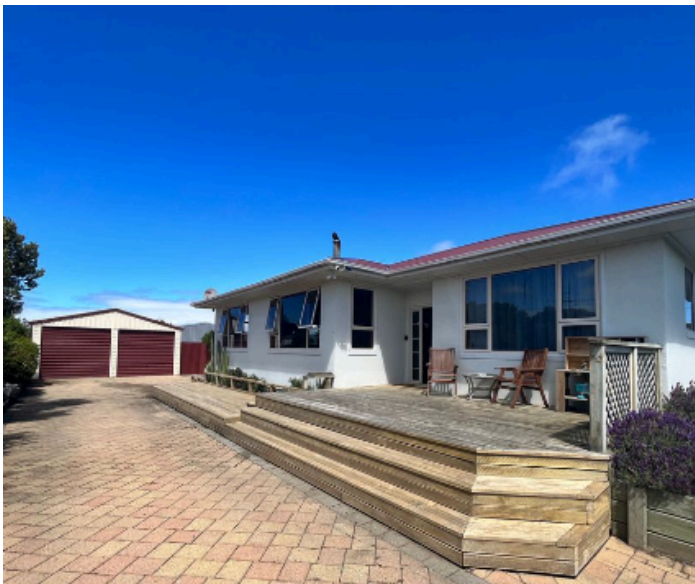
109 Havelock Street, Riverton