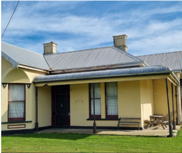
78 Palmerston Street, Riverton