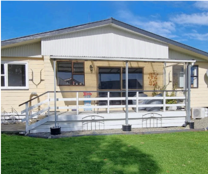
B/138 Havelock Street, Riverton